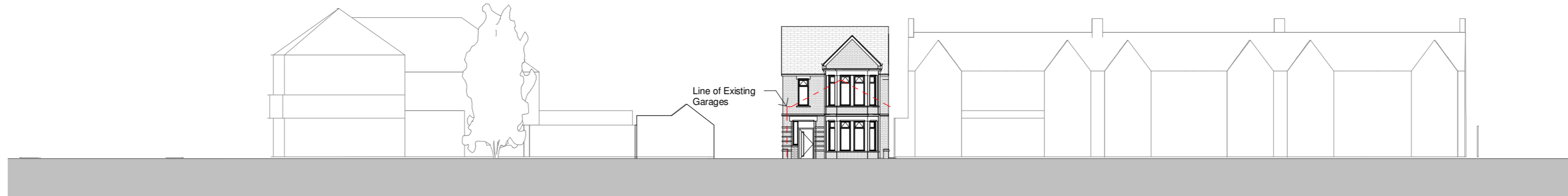
Site Elevation East 1 : 250

Notes This drawing may be scaled for the purposes of Planning Applications, Land Registry and for Legal plans where the scale bar is used, and where it verifies that the drawing is an original or an accurate copy. It may not be scaled for construction purposes. Always refer to figured dimensions. All dimensions are to be checked on site. Discrepancies and/or ambiguities between this drawing and information given elsewhere must be reported immediately to this office for clarification before proceeding. All drawings are to be read in conjunction with the specification and all works to be carried out in accordance with latest British Standards / Codes of Practice.